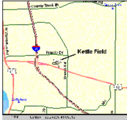
Long Island Sod Farm